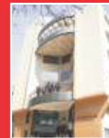
IBMR Campus Hubli