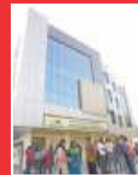
IBMR Campus Ahmedabad