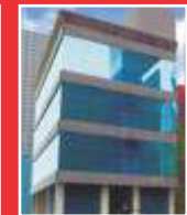
IBMR Campus Bangalore