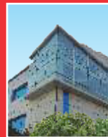
IBMR Campus Gurgaon