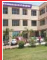
IBMR Delhi NCR Campus