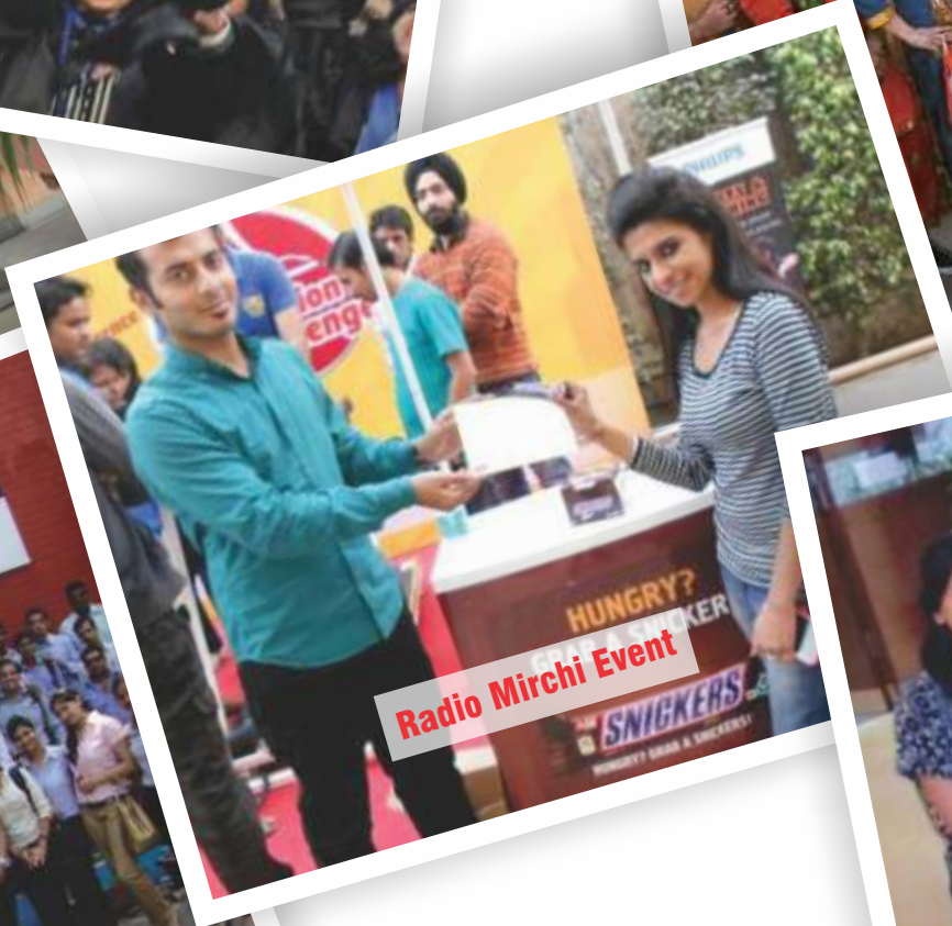
Radio Mirchi Event