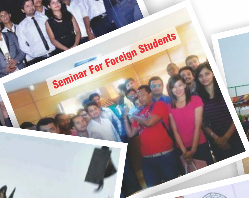
Seminar For Foreign Students