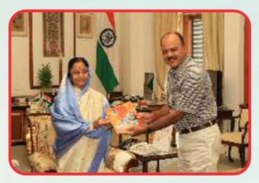
WITH HON'BLE PRESIDENT OF INDIA SMT PRATIBHA DEVISINH PATIL JI