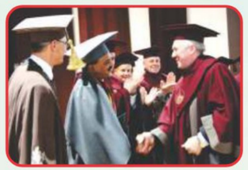
RECEIVEING D.LIT. DEGREE FROM ERASMUS-EUROPEAN UNION UNIVERSITY