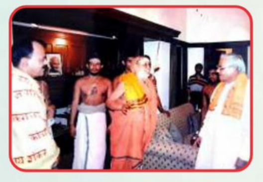
GREETING THE THEN P.M. OF INDIA SH ATAL BIHARI VAJPAYEE JI