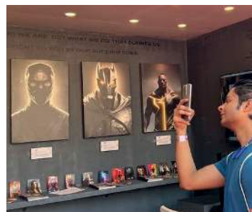
Comic Con Delhi, 2022