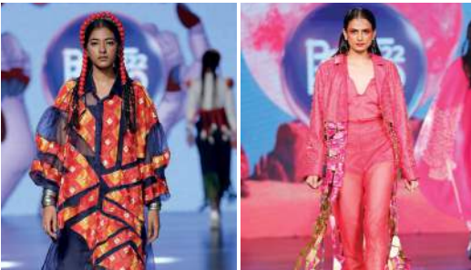
Student work showcase at Portfolio, 2022