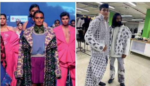
Pearl Academy x Graduate Fashion Week International 2022