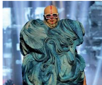
Student work showcase at FDCI x Lakme Fashion Week